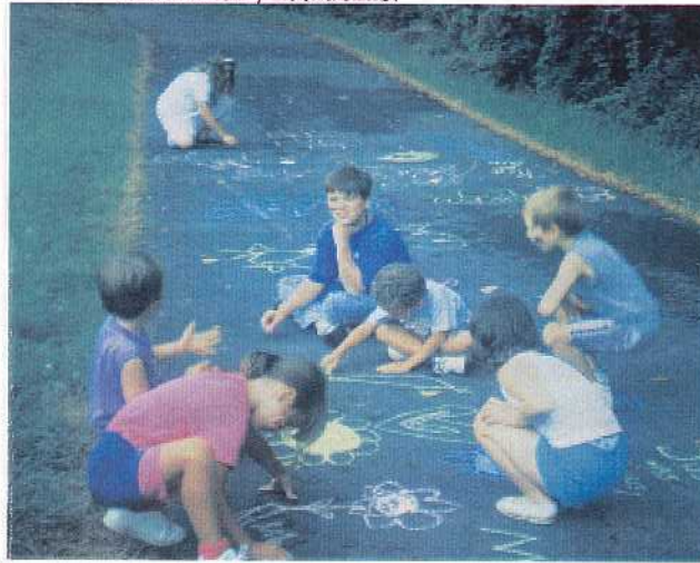
Children enjoying their community greenway add color and personal love to the environment. Future sidewalks like this one will be used by families and individuals everyday.

lover. Individuals and families, hikers, joggers, cyclists and equestrian lovers will have a place to enjoy the natural and cultural heritage of Martin. The quality of life will improve for Martin city residents.